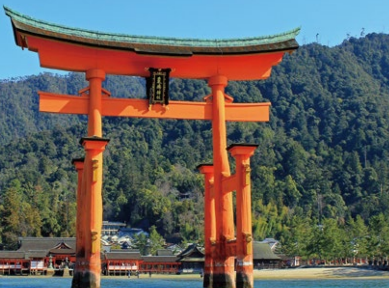
photo: The Great Torii of Itsukushima Shrine, a UNESCO World Heritage site © Hiroshima Prefecture

Promoting Diversity in Research and Research Management Collaborations: More Trans-national, More Trans-disciplinary, More Trans-sectoral